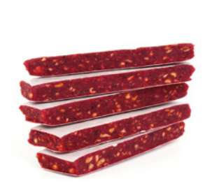
BARS (ENERGY, PROTEIN)

to boost consumer preference and differentiate your functional food and beverage brands